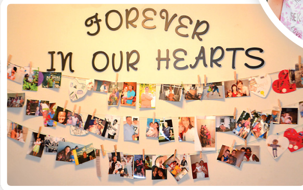
Children post pictures of their lost loved ones so they can share memories with each other.