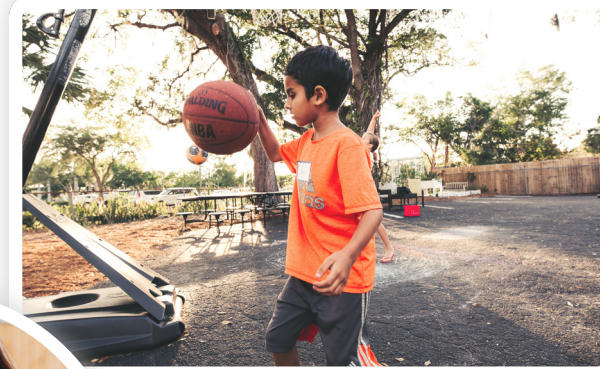
Children spend time unwinding and playing games before grief support groups begin.

Valerie's House support programs are designed to give children ages 4-19 years old and their families a safe place to share, grieve and grow. Valerie's House relies on the use of art and music and other creative activities to help our youth identify, express and process their grief.