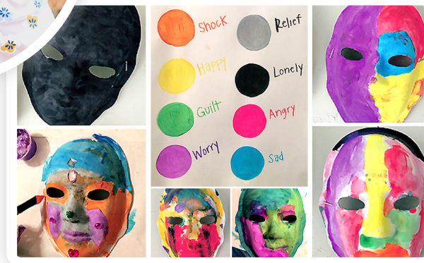
Children paint their masks with colors representing their different emotions to communicate their grief.

Our programs are provided free of charge, thanks to generous donations, grants, and volunteer support.